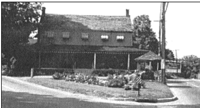
"Henn's Tavern," where Jackson Avenue met Hamburg Turnpike (at Old Homestead Road), stood as a tavern, stagecoach stop, and private residence for over a century.