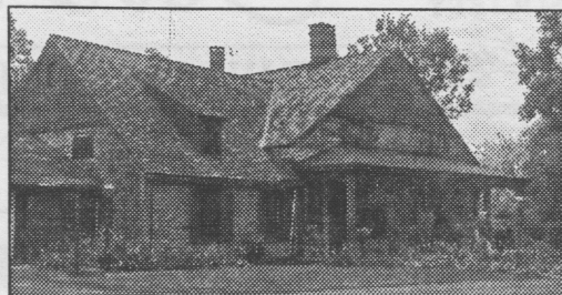
One of the beautiful Stone Homes at historic Hurley, New York

"I thank the genealogy club for the opportunity of serving."