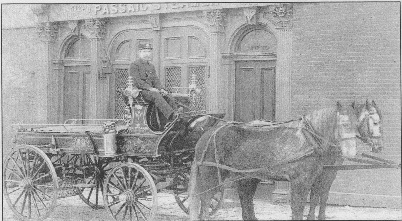
Passaic Steamer Company (undated photo)