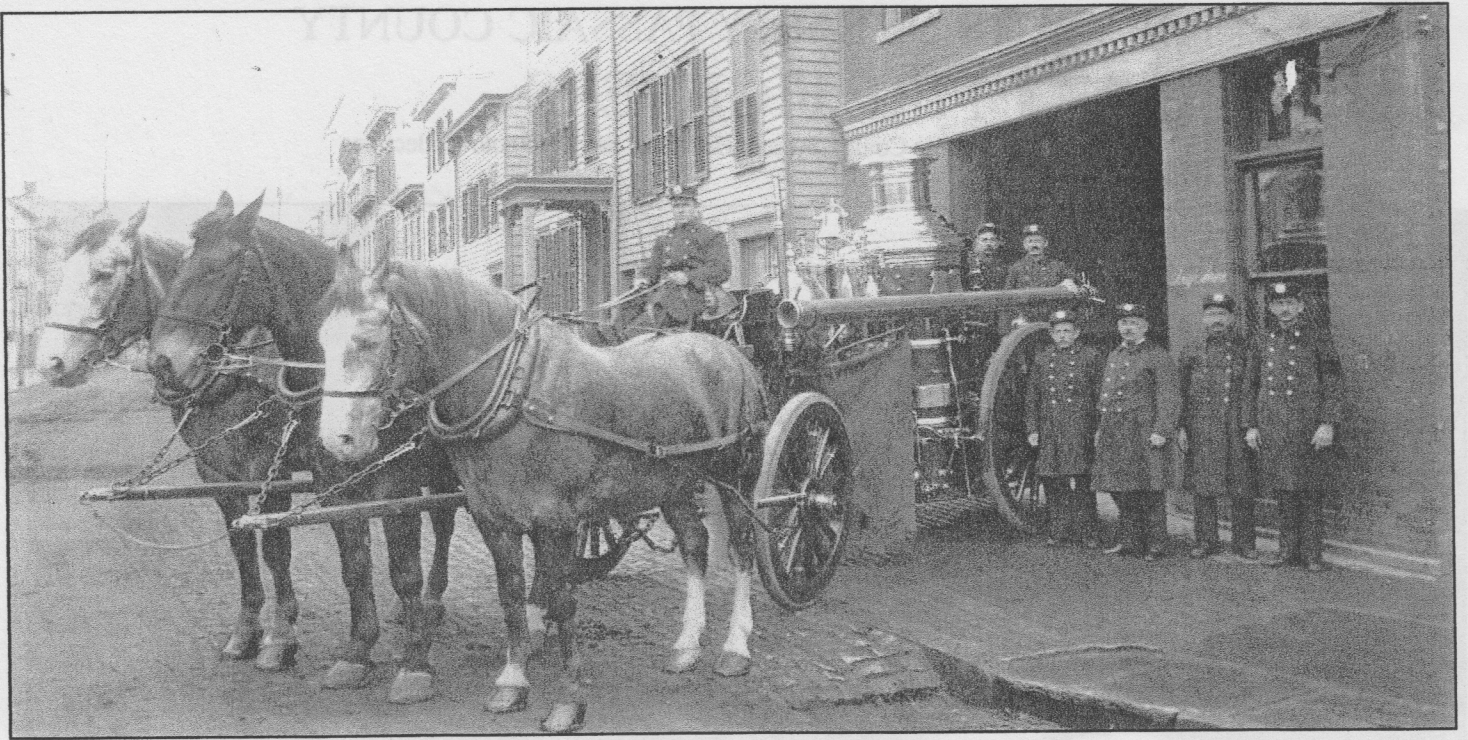
Paterson's Engine Company No. 5 in this post-1902 photo was located on Water Street, west of Temple Street. The steeple of the Second Reformed Church can be seen in the distance on the left. Notice the "high water mark" from the flood of 1902 on the building before which the firemen are standing. Company No. 5 was later relocated to Van Houten Street.