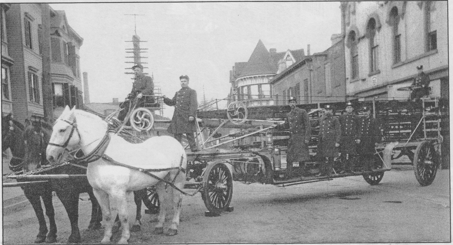
This undated photo of Paterson's Hook and Ladder Company No. 2 was located on the east side of Prospect Street (then number 615) near Ellison Street.