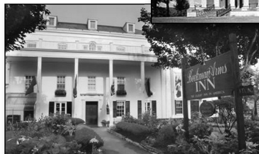
Beekman Arms Hotel and Inn

We wish everyone a Happy and Healthy Summer. We look forward to seeing you in September.