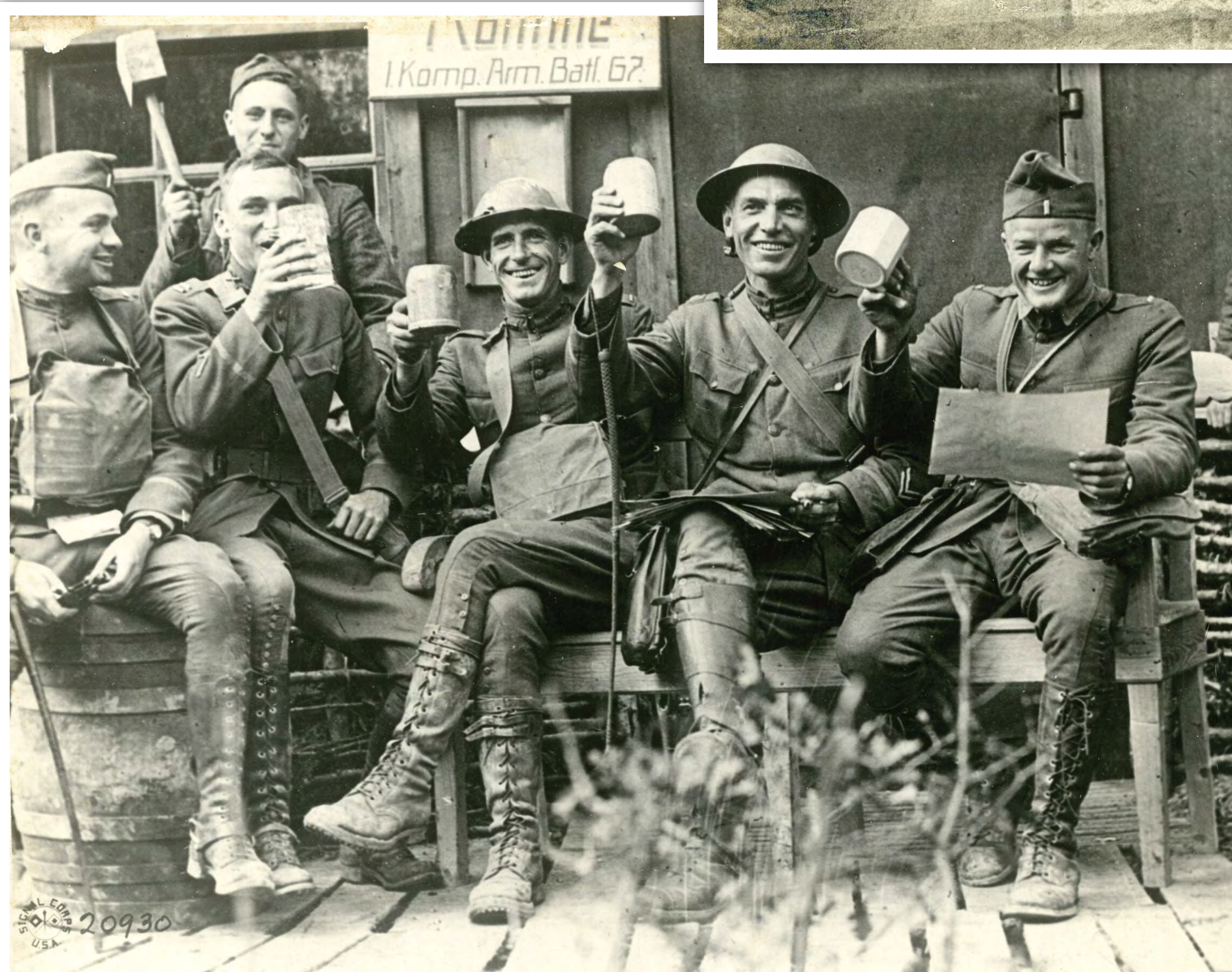
American officers make merry at a captured German canteen at the battle of St. Mihiel, France. Taken for Signal Corps USA, 1918.