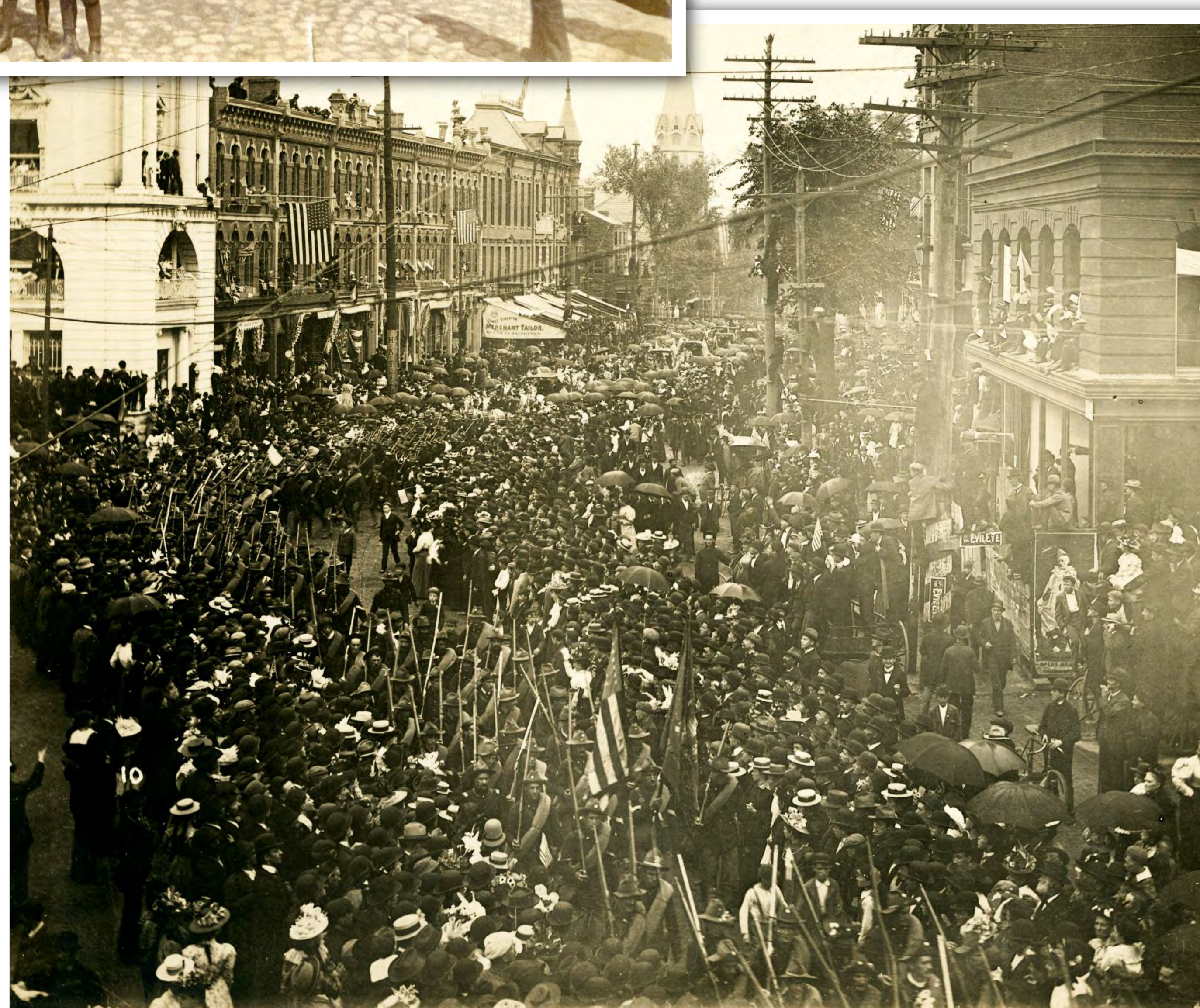
Members of the National Guard parade down Paterson's Main Street, circa 1898.