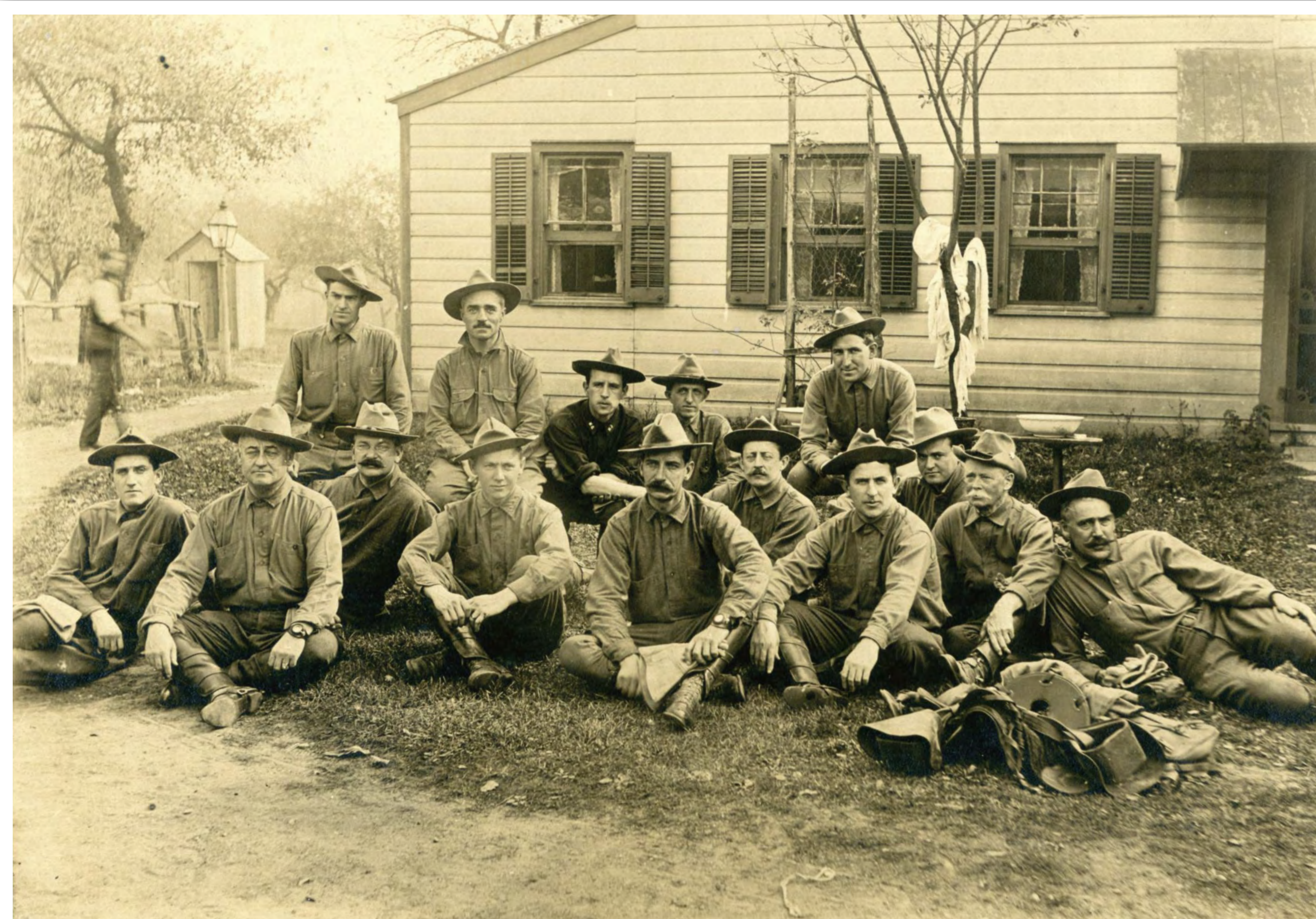
New Jersey National Guardsmen at camp, circa 1898.