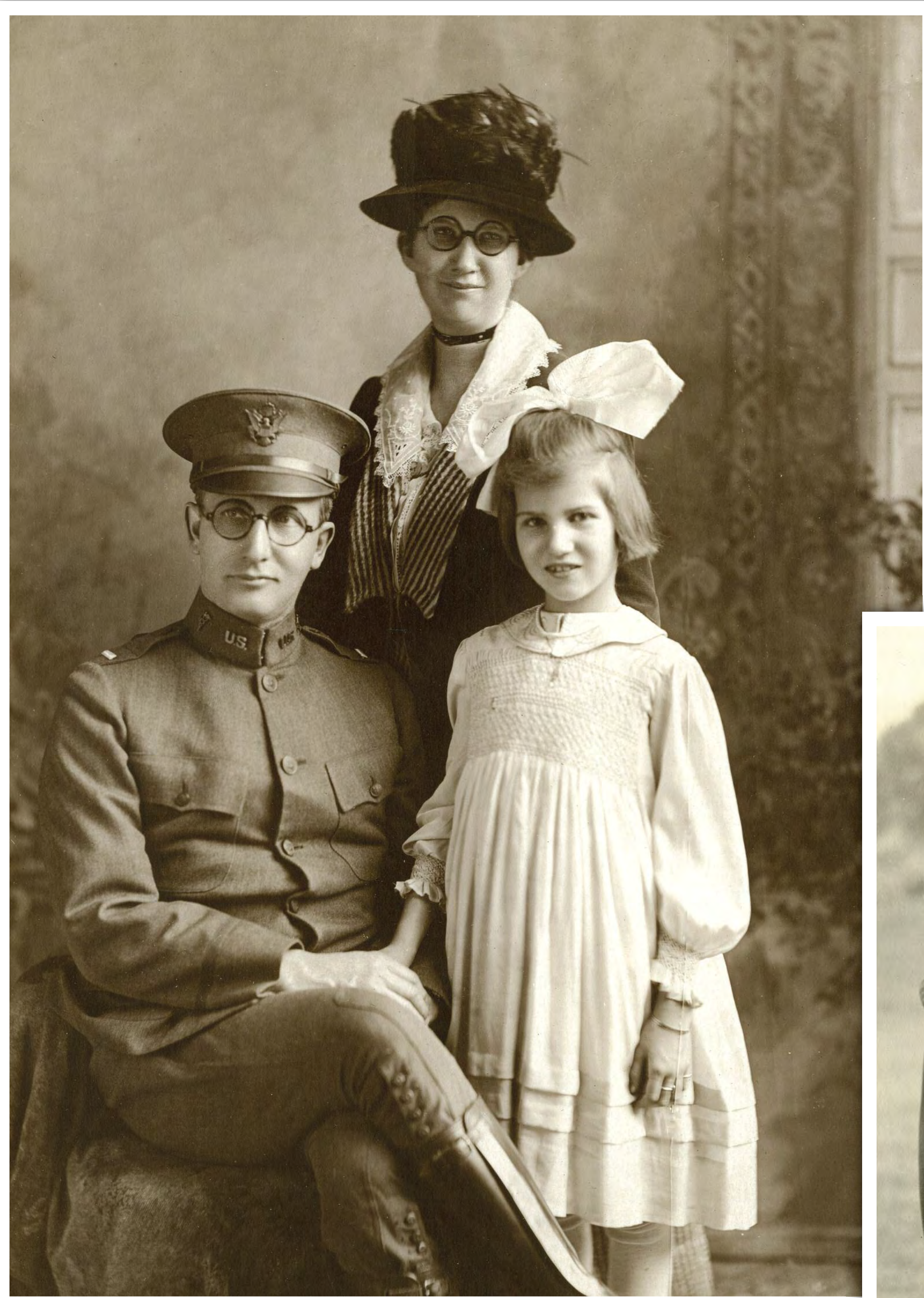
A medical officer poses with his wife and daughter, circa 1917.