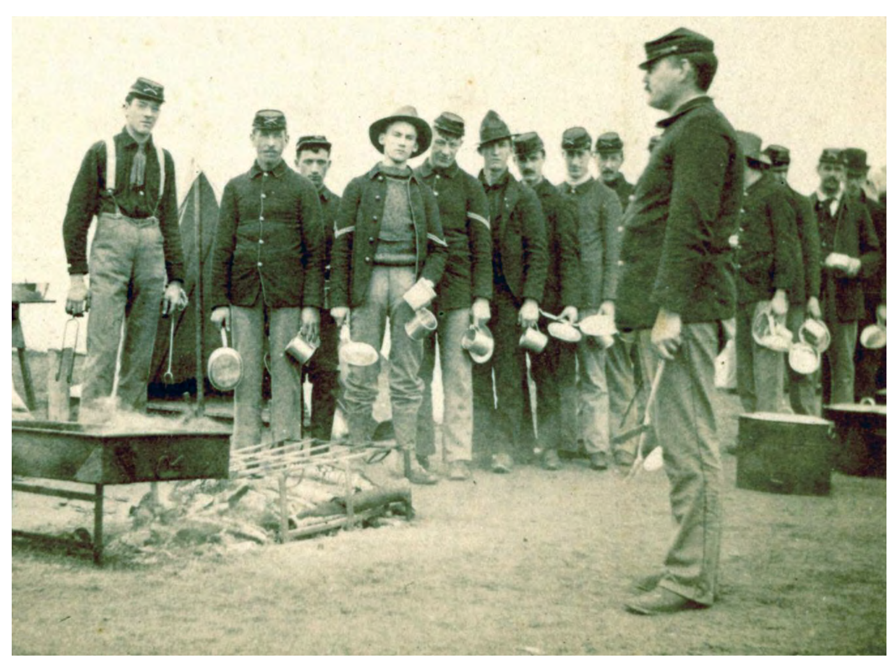
Members of the 2nd Regiment New Jersey Volunteer Infantry line up for chow. Taken at the Jacksonville Florida encampment, 1898.

This exhibition does not focus on the photographs as a point of historical reference. Instead, these photographs were selected as a representation of the common experience of all soldiers. Their uniforms, equipment, and weapons changed over time, but their fears, triumphs, and trials remained constant.