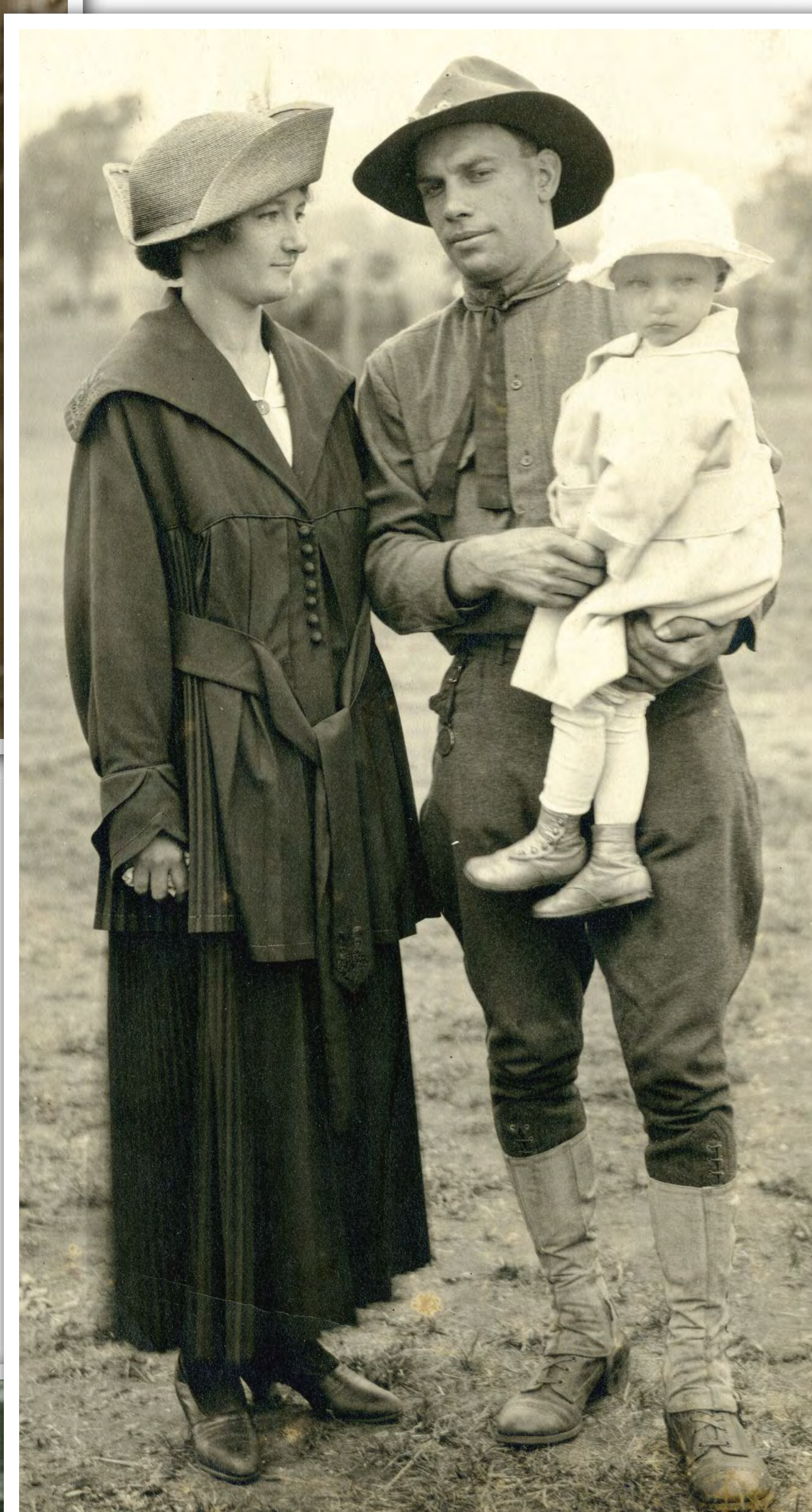
A soldier and his family, circa 1917.