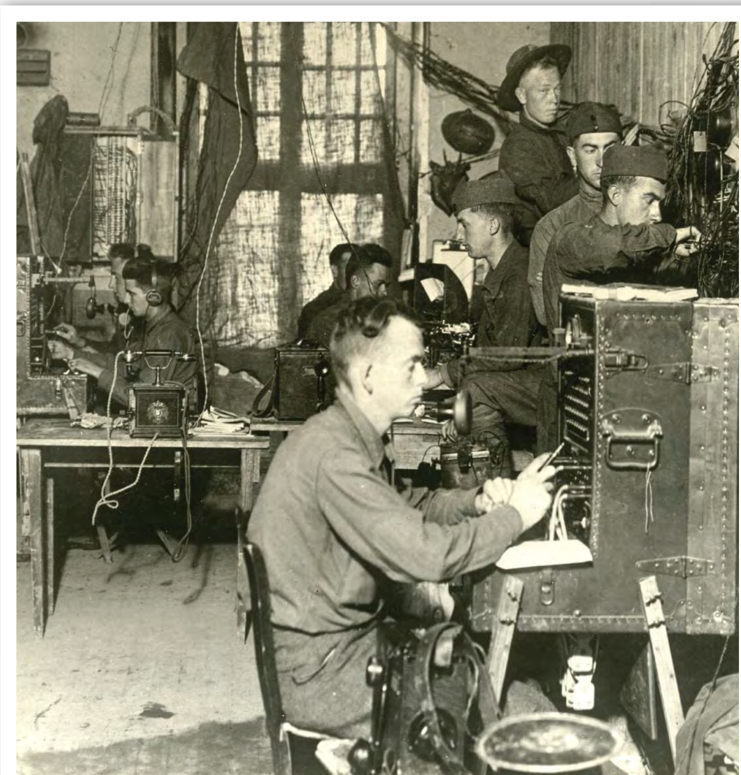
The American Field Signal Battalion's telephone switchboard in operation during the battle of St. Mihiel.

All of the photographs included in this display were taken from the collection of the Passaic County Historical Society. Some photographs have no associated information and the soldiers, sailors and airmen are unidentified, yet the photographs speak to their experience in a way that requires no context.