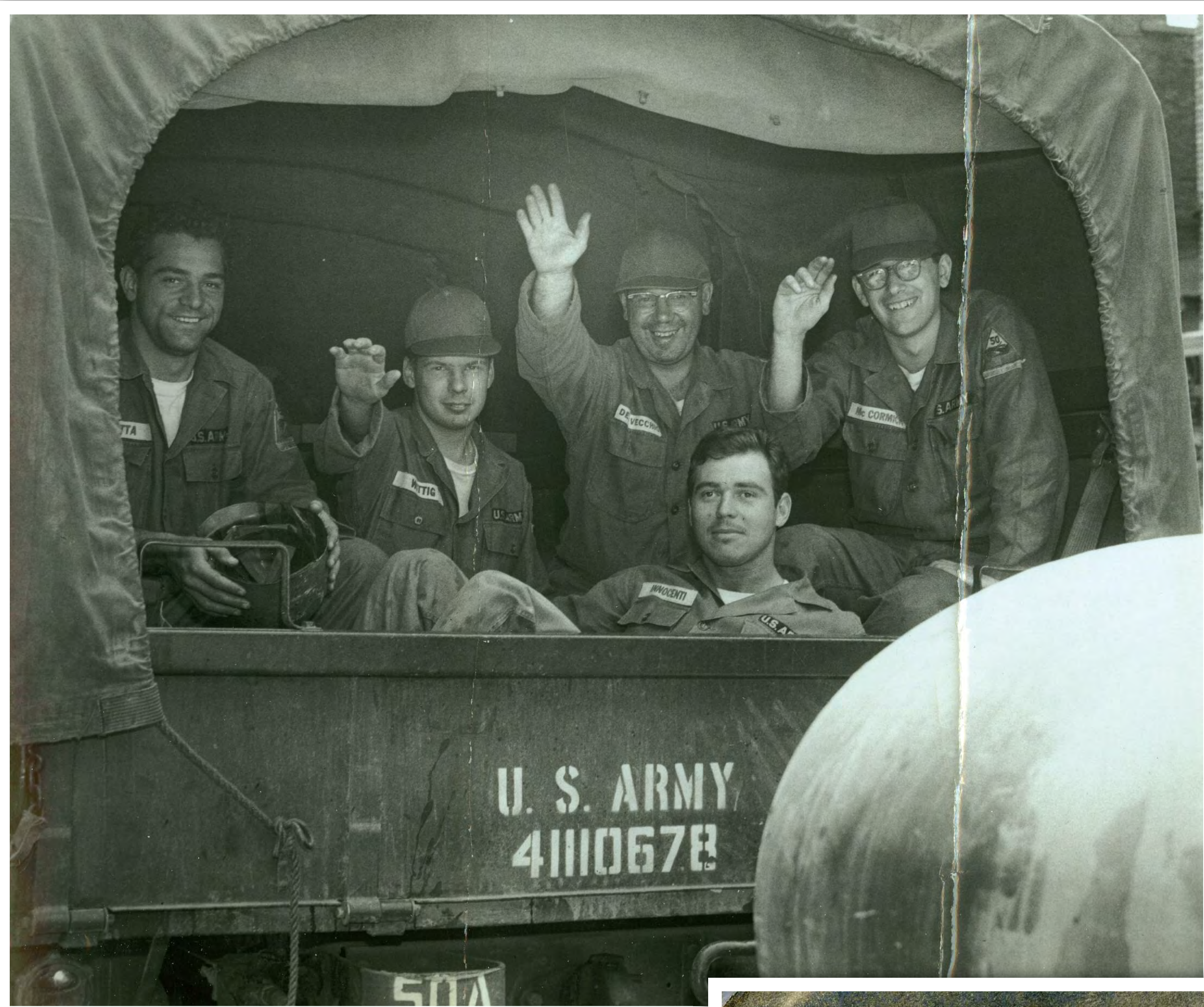
Members of the 50th Armored Division, National Guard return to Paterson in 1964.

Paterson Evening News Collection, 2012.039.8265