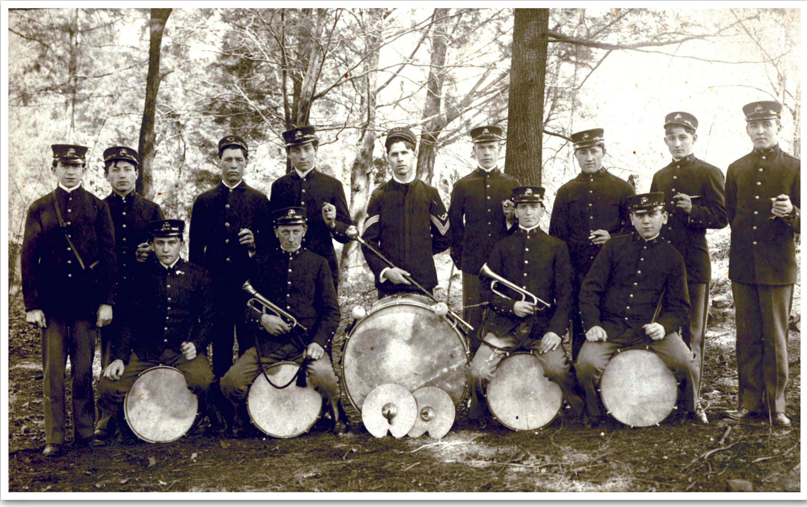
US Marine band, circa 1880. PCHS Collection, 1983.15