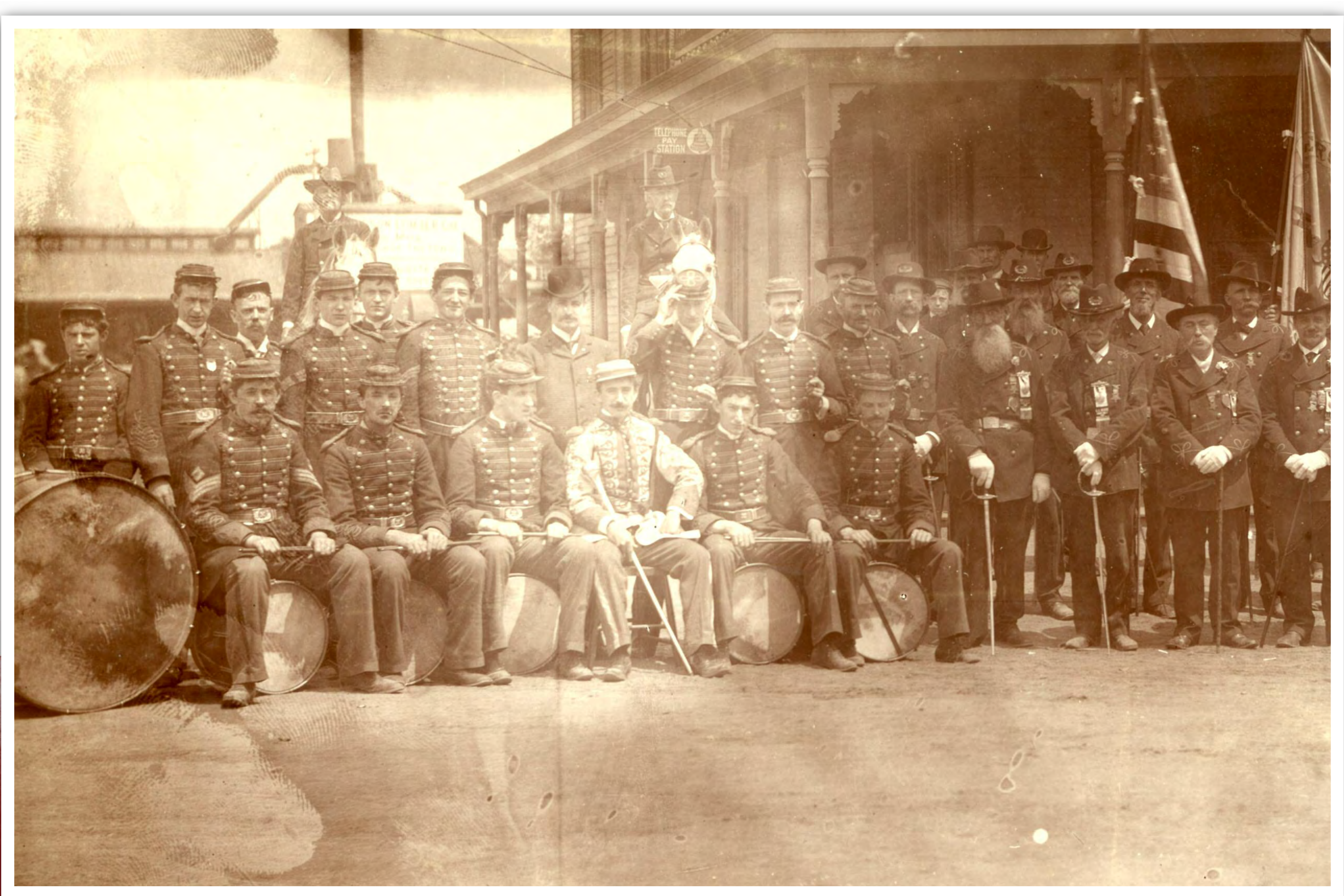
The George G. Mead Post, in Passaic. The drum corps band (left) and members of the Grand Army of the Republic, veterans of the Union Army (right).