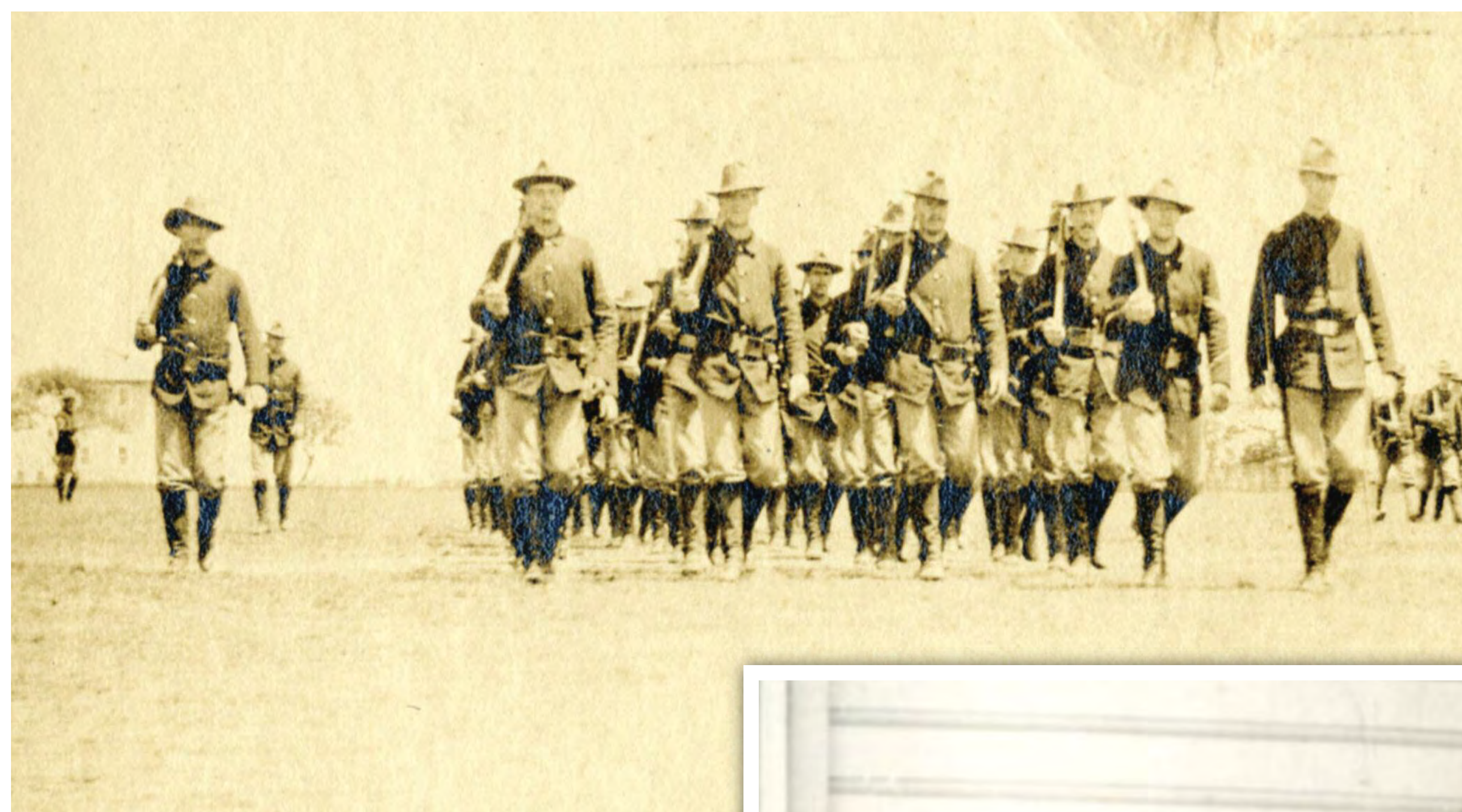
Soldiers drilling in the field, circa 1898.