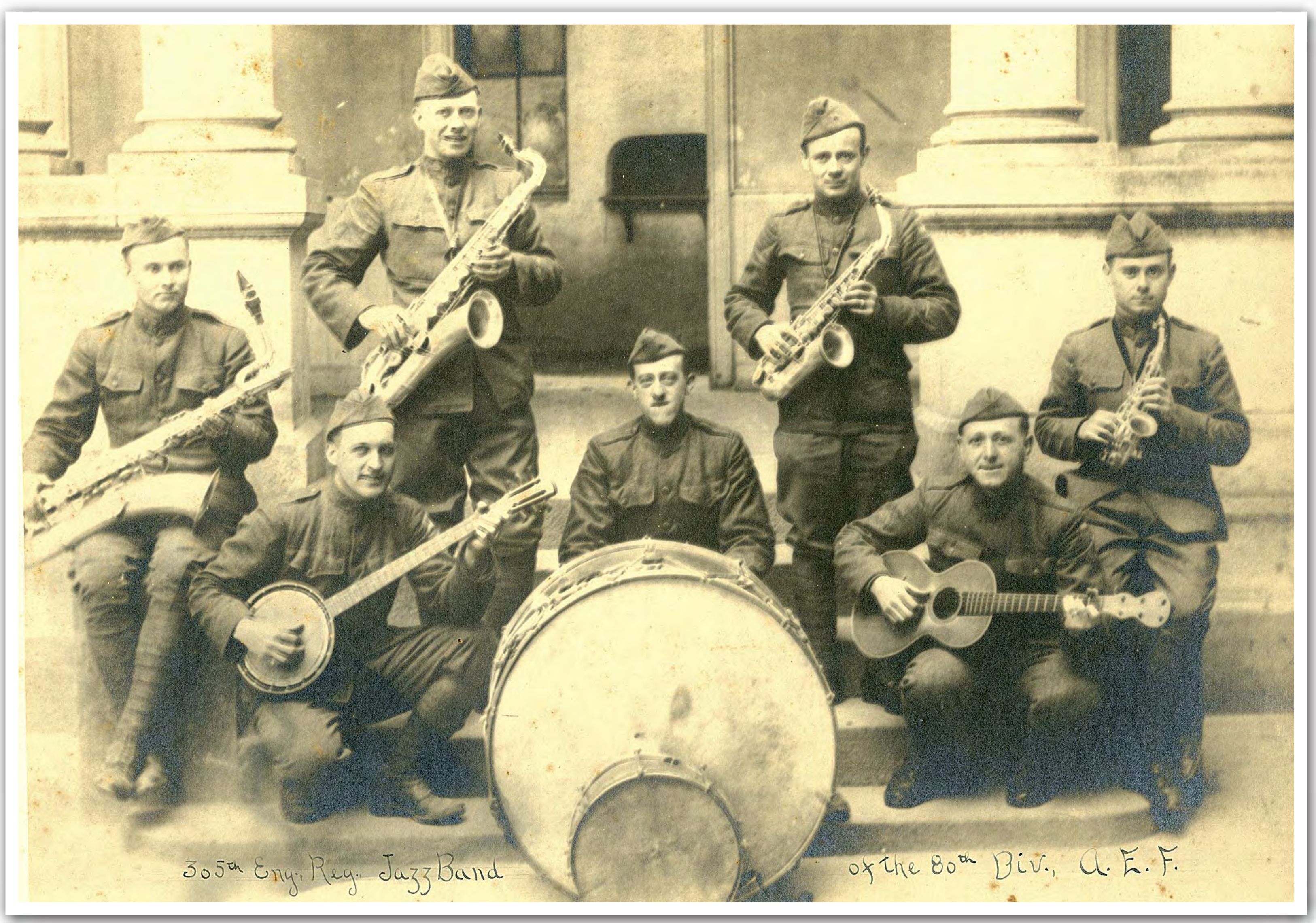
Members of the 305th Engineering Regiment Jazz Band. This regiment was part of the 80th Division, 1917.