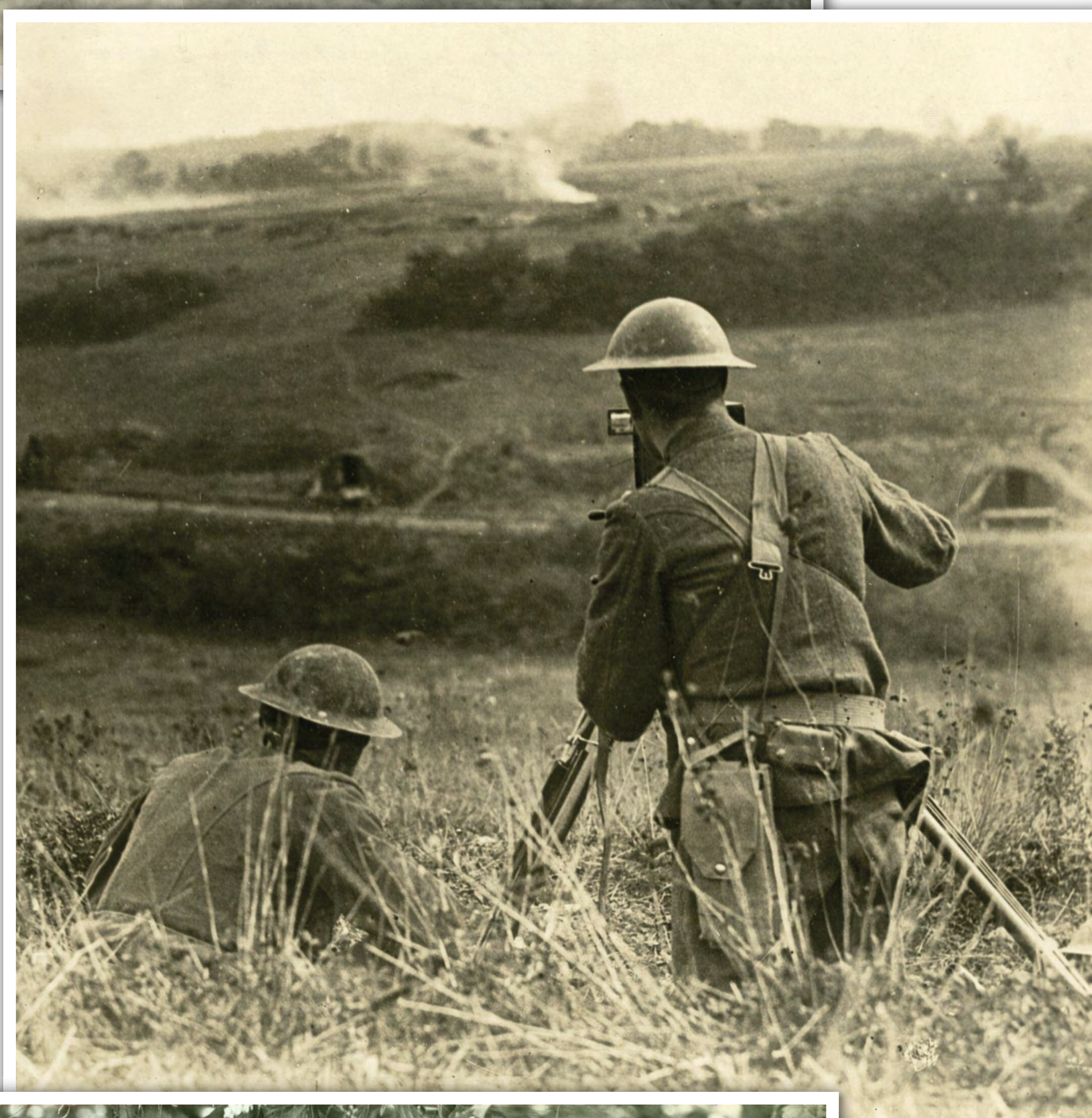
Filming a battlefield during an artillery bombardment in France. Taken for Signal Corps USA, 1918.