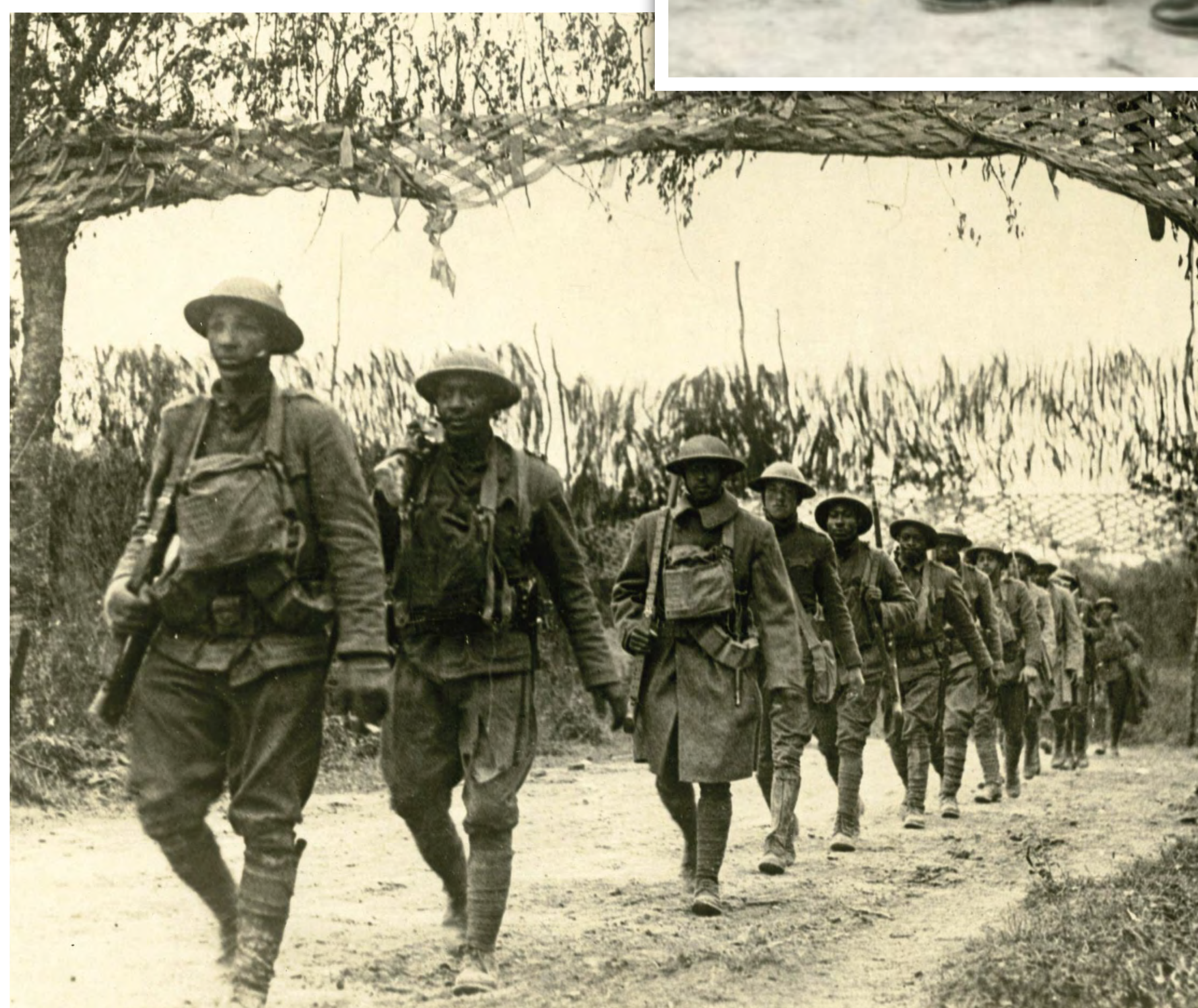
A unit of African-American infantrymen advancing toward the front in the Argonne, northwest of Verdun France. Taken for Signal Corps USA, circa 1918.