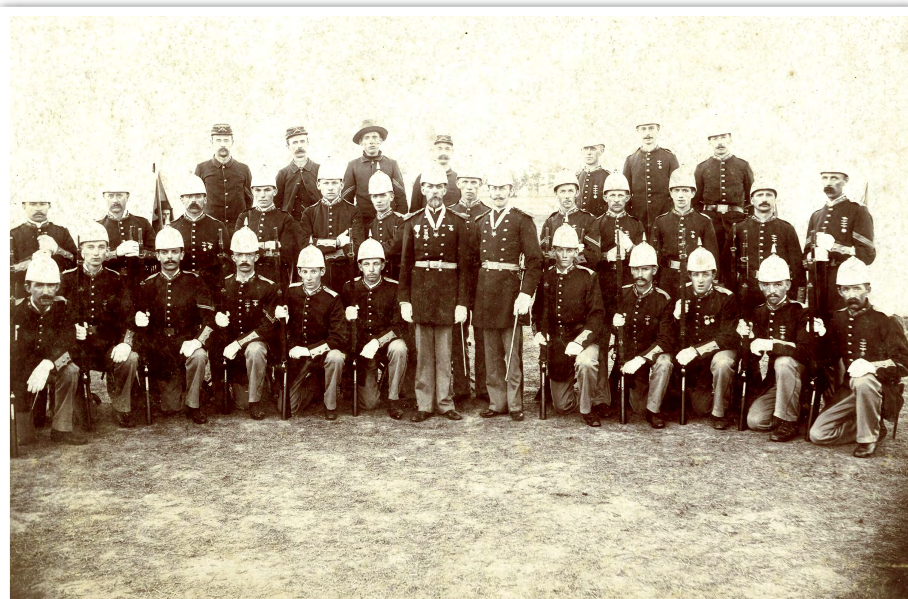
The Fourth Regiment, New Jersey National Guard. Taken at Camp Werts, 1895.