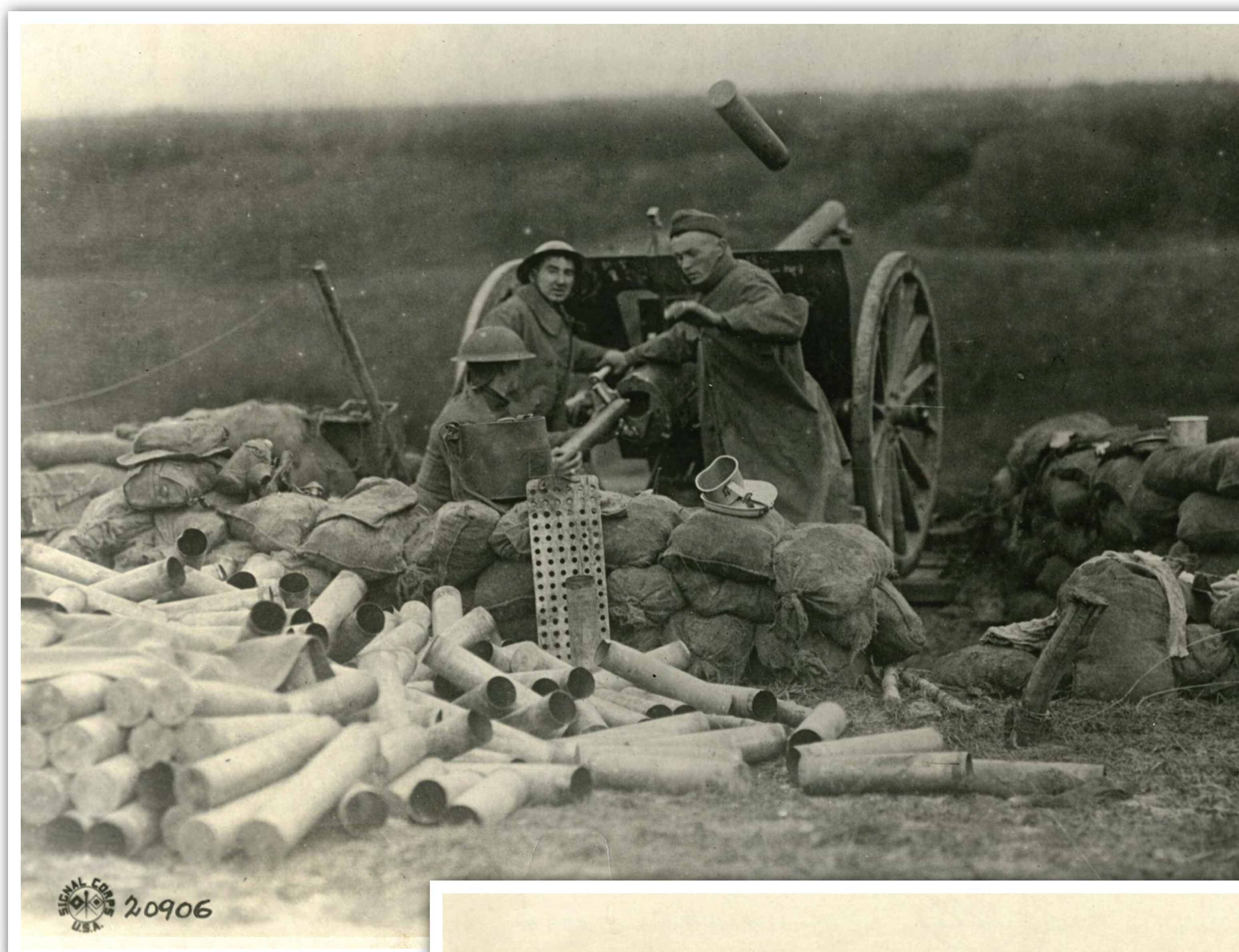
American gunners, working at top speed during the Battle of St. Mihiel, France.