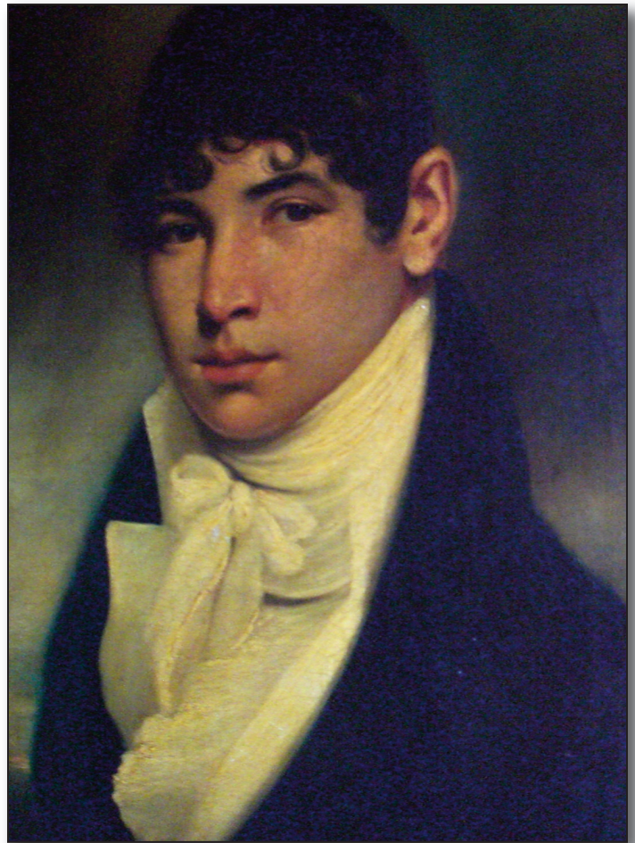
Self Portrait, 1798.

Based on the markings on the base of the PCHS tea set, which read "Manufacture de S.M. l'Impératrice, P.L. DAGOTY A. PARIS," our set dates to imperial production, sometime between 1804-1814. A matching tea cup and saucer can be found in the collection of Musee National du Chateau de Malmaison, France, home of the Napoleonic National Museum. Therefore, our tea set was never owned or used by Josephine Bonaparte. It was however, designed with her tastes in mind.