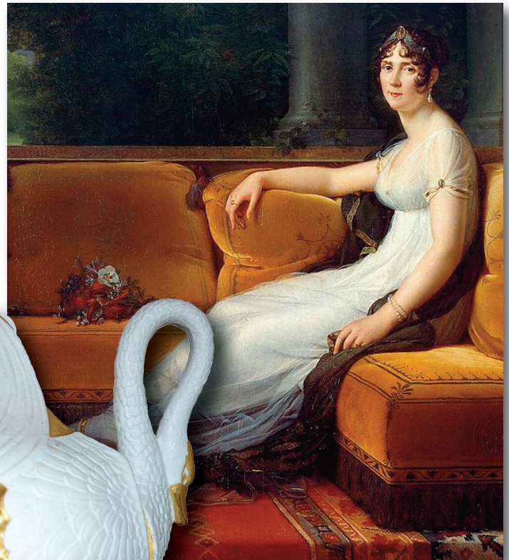
Madame Bonaparte dans son salon de Malmaison. Painted by François Gérard, 1770-1837.

The question of how the tea set crossed the pond and entered the United States could also be explained. Several members of the Bonaparte family were familiar to America in the early 1800s. Indeed, Napoleon's younger brother Jerome was married to an American in 1803. The subsequent emigration of several members of the family following the Emperor's fall from power, including his brother Joseph's relocation to Point Breeze NJ, certainly makes the tea set's journey seem plausible.